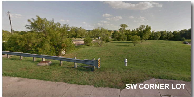
SW CORNER LOT